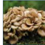
Maitake Grifola frondosa / Hen-of-the-woods Page 16