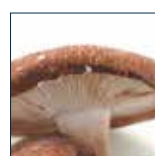
Shiitake Lentinula edodes Page 21