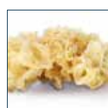
Tremella fuciformis Snow fungus, silver ear fungus, white jelly mushroom Page 23