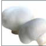
Agaricus bisporus White button mushroom Page 8