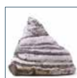
Tinder fungus Fomes fomentarius Page 22