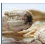
Coprinus comatus Shaggy ink cap Page 12