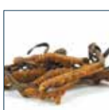
Cordyceps sinensis Chinese caterpillar fungus Page 13