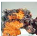
Chaga Inonotus obliquus Page 11