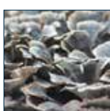
Coriolus versicolor Turkey tail Page 14