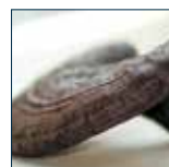
Reishi Lingzhi / Ganoderma lucidum Page 20