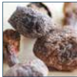
Agaricus blazei murill ABM Page 9