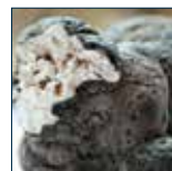
Polyporus umbellatus Umbrella polypore Page 19