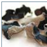
Auricularia polytricha Wood ear Page 10