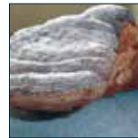
Meshima Phellinus linteus Page 17